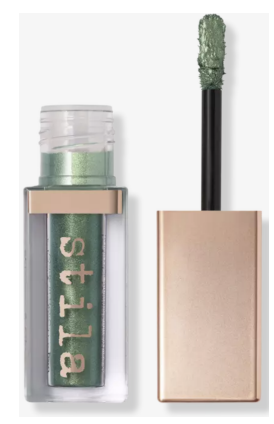
Shimmer & Glow Liquid Eye Shadow